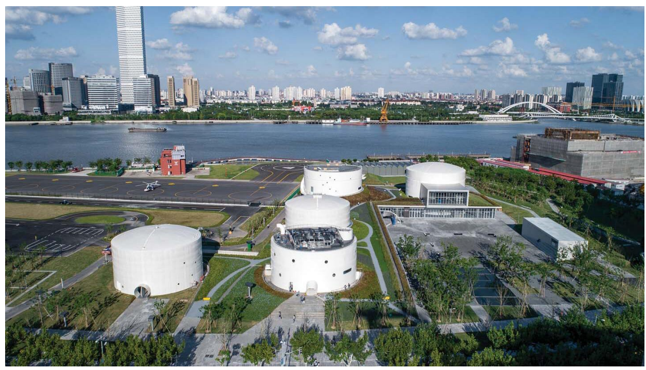
TANK Shanghai, 2380 Longteng Avenue, Shanghai, China. February 3, 2023